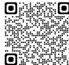
RMI Career Fair Video

To spread the word about RMI and GIS, the program has created two videos! The first focuses on the broader student population and illuminates the career opportunities in the insurance industry and the annual RMI career fair. The second video focuses on promoting student involvement in the GIS student organization. Please check them out.